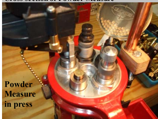
Powder Measure in press